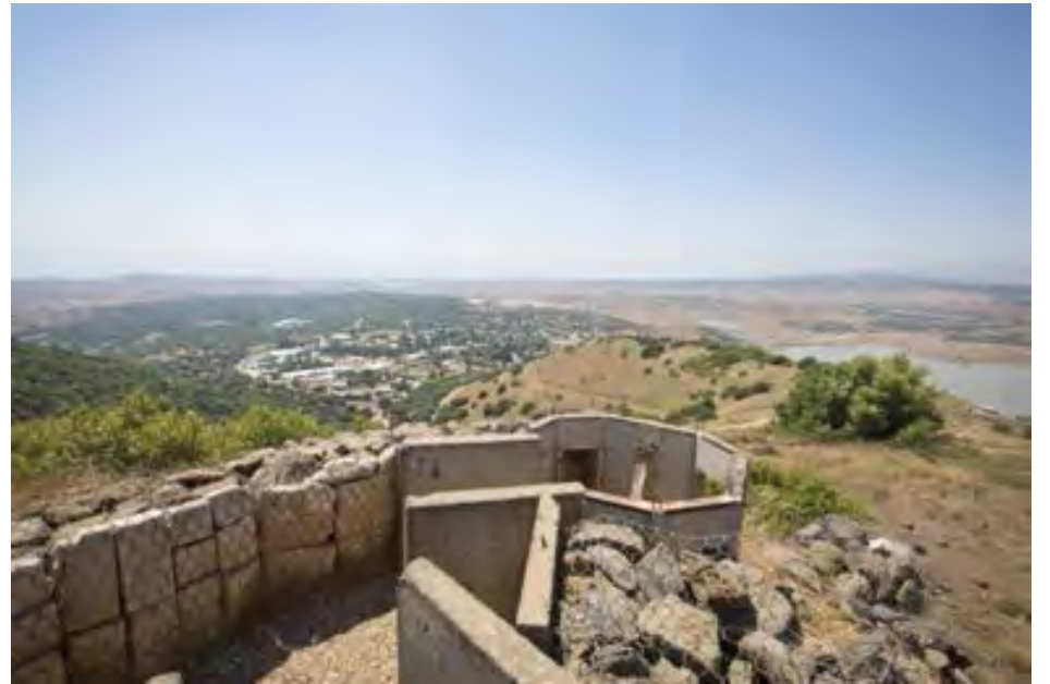
A turret stands on Mount Bental in Israel and looks down over the Golan Heights in Syria.

The $3.5 trillion budget proposal also reflects a leader who is a complete amateur, he said. The biggest elements are defense spending and health care spending.